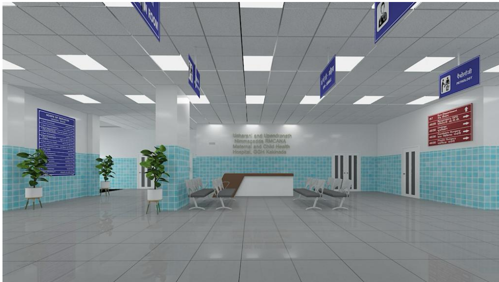
Reception area (Ground floor)