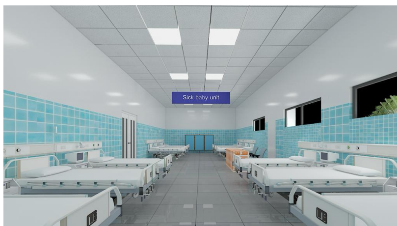
Sick baby unit (Ground floor)